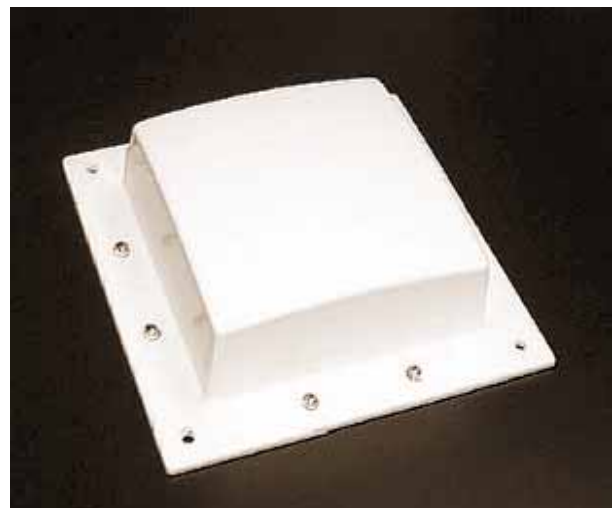
Model MCR03-04-N reduced sized patch